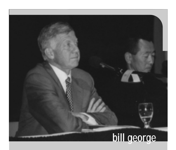
" Why not give it all away? After all, how much do we really benefit from trying to consume our wealth? Do we really help our children and grandchildren by setting them up with trusts and estates so they don't have to work, as we and our parents did, to earn a living?"