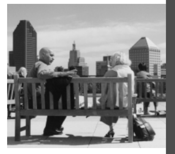
The Sharing the Wealth summit was held at the Minnesota History Center in Saint Paul, Minnesota, September 7-8, 2000.